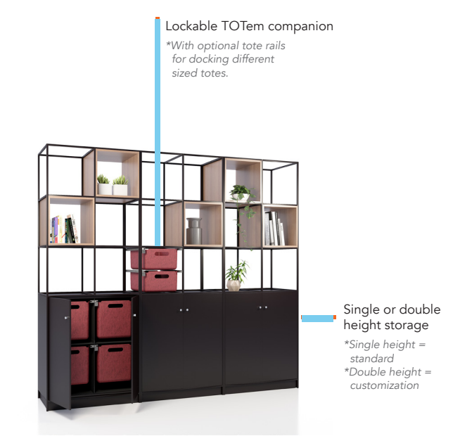
Base options include lockable hinged doors, digital locks, and manual keyed (alike or random) locks

Keep Q-ZONE as a frame for storing our portable workstation or ask about other inserts & accessories.